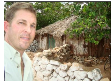
In the background is a traditional home of the local villagers in the Yucatan Peninsula of Mexico

Through referral sources such as physicians, hospitals, community groups, and religious organizations, or by "word of mouth," we treat patients with orthopedic needs. We also enlist the help of other health professionals as the needs arise in order to maximize the quality of life of each patient.